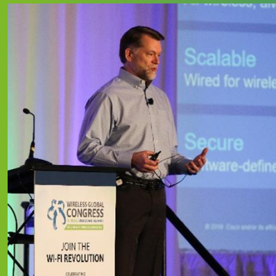
Cisco, CTO Wireless WBA Board Member