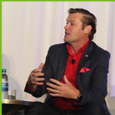
Boingo Wireless, CTO WBA Co-Chair