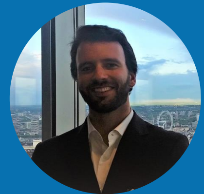
WBA, CTO Global Programs