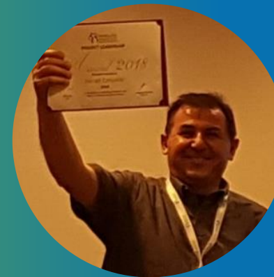
Intel and WBA, WBA Board Member CTOG Co-Chair